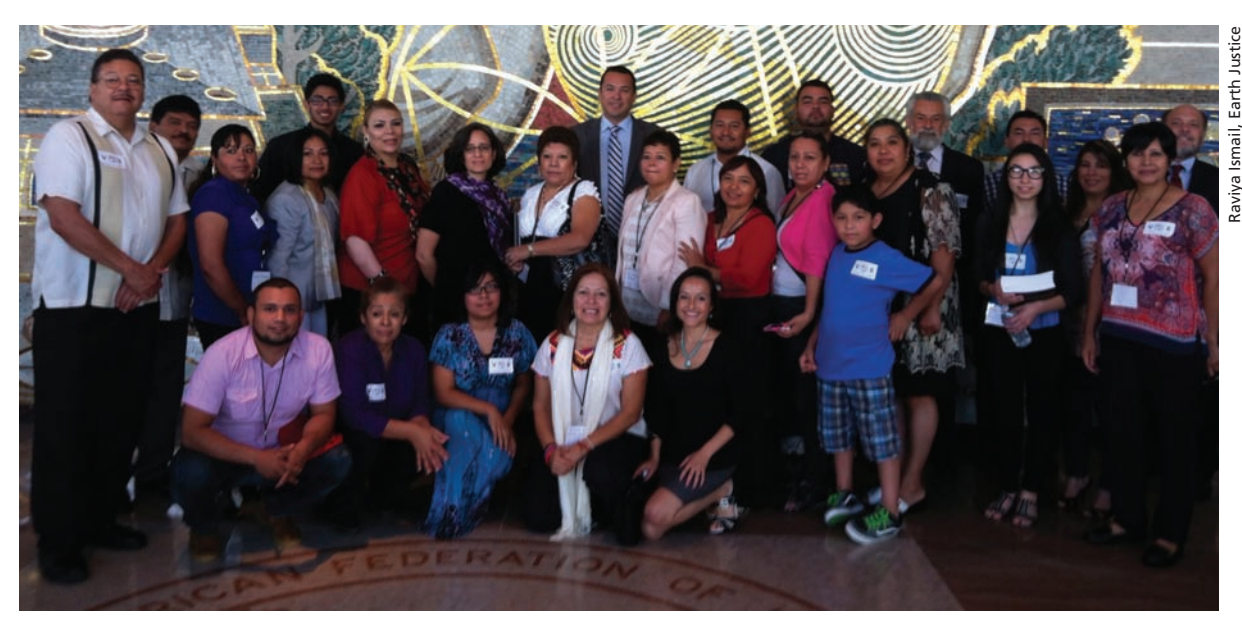
Farmworkers converged on Capitol Hill to urge action on updating EPA's Worker Protection standard.

their advocates. Today, undocumented workers are vulnerable to exploitation by employers, who may threaten workers with deportation if they complain about violations of wage or health and safety laws. The Senate bill allows undocumented workers already in the country to apply for legal status and eventual citizenship. It also creates a new "W visa" program for immigrant workers to fill low-skill jobs, and employers can lose eligibility to hire immigrants through this program if they repeatedly or willfully violate wage and overtime rules or if repeated or willful violations of child-labor or health-and-safety regulations lead to a worker's injury or death. As of this writing, the U.S. House of Representatives has yet to vote on this or other immigration-reform legislation.