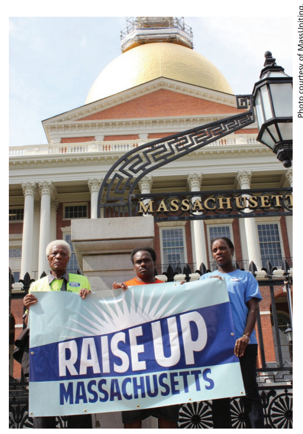
The Raise Up Massachusetts Coalition is working to get measures onto the state's ballot to increase the minimum wage and assure workers' ability to earn sick time.

The Progressive States Network reports that in 2013, 19 states and the District of Columbia have minimum wages above the federal $7.25/hour requirement. See their map of state minimum-wage laws at http://bit.ly/1aLkssl.