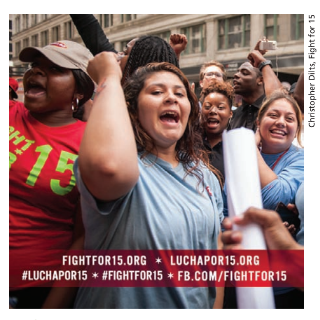
Fast-food workers in Chicago and other cities have walked off the job on one-day strikes to demand better wages and working conditions

The financial struggles of workers in full-service restaurants are also gaining wider recognition, thanks to the Restaurant Opportunities Center (ROC)-United. Co-founder Saru Jayaraman released her book Behind the Kitchen Door (Cornell University Press) on February 13, or 2/13 – a date that has special significance in the restaurant world, where the hourly wage of most tipped restaurant workers has been stuck at $2.13 per hour since 1991. Workers' tips are supposed to be sufficient to bring their hourly wage up to the minimum wage; when they don't, employers are supposed to make up the difference, but restaurant workers report that they're often left with belowminimum-wage earnings. ROC affiliates in cities across the country help workers fight for better employment conditions while also highlighting "high road" restaurants that create "win-win" solutions for workers, diners, and employers alike.